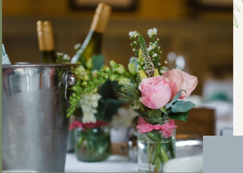
Table Decoration Bronze

A mix of flowers colours to be chosen In a jam jar x10 @£20 each= £200